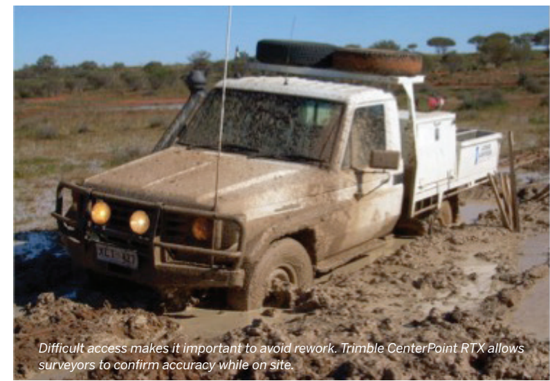
Difficult access makes it important to avoid rework. Trimble CenterPoint RTX allows surveyors to confirm accuracy while on site.

But there's still plenty of room for improvement. "If the digital data is more accurate, then aerial imagery and future planning can work from more accurate maps and GIS," D'Aloia explains. "It helps avoid issues when ground surveys attempt to tie aerial imagery to existing monuments. The difficulty arises in bringing accurate measurements to the remote locations."